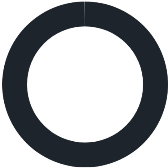
Sale Method *